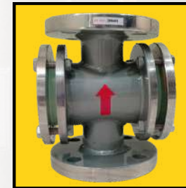
Double Window Sight Glass

Range : 15 NB to 400 NB MOC : CI / M.S / C.S / SS304 / SS304L / SS316 / SS316L / PTFE Lined Pressure Rating : Up to 40 kg/cm 2 Temperature Rating : Up to 200 °C Connection : Flange End