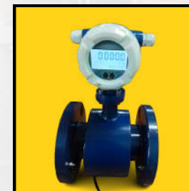
Electromagnetic Flow Meter

Range : 15 mm to 1000 mm Body Material : CS / SS 304 / SS 316 Electrode : SS 316 / Hastelloy B / Hastelloy C Pressure Rating : 0.6 to 4.0 MPa Connection : Flange End / Tri-clamp / Thread