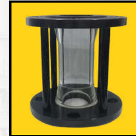
Full View Sight Glass

Size : 15 NB to 150 NB MOC : M.S / C.S / SS304 / SS304L / SS316 / SS316L / PTFE Lined Pressure Rating : Up to 10 Kg/cm 2 Temperature Rating : Up to 200°C Connection : Flange End